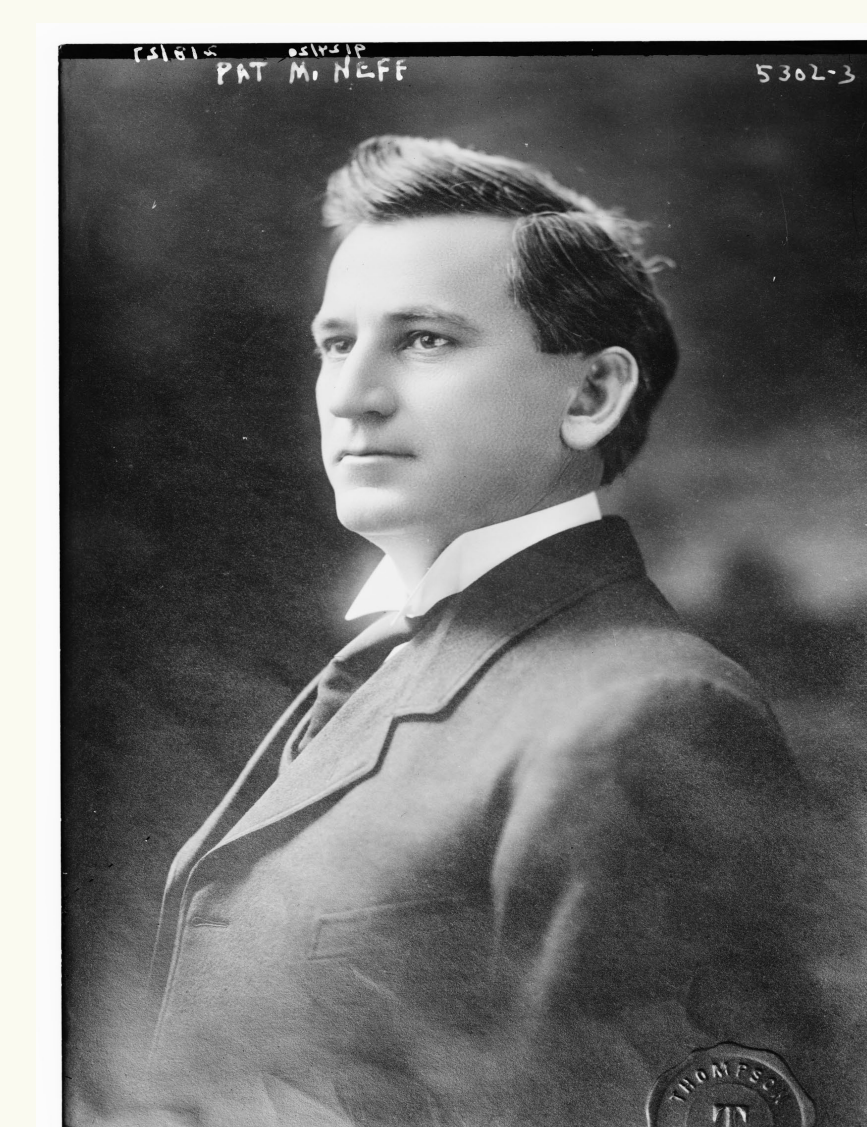
Texas Governor Pat Neff